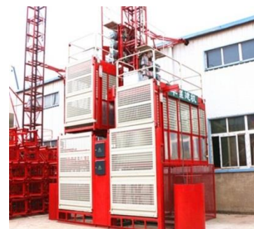
FYG Passenger Hoist