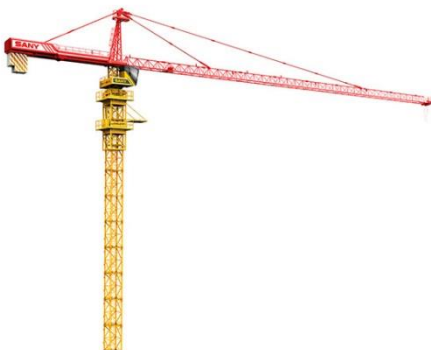
FYG Tower Crane