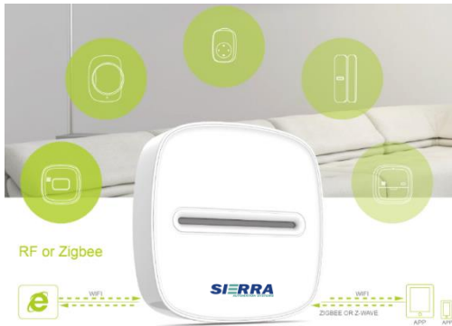
SIERRA Residential & Commercial Automation System