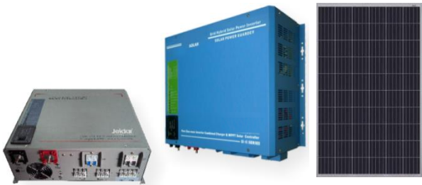
SIERRA Solar Power Systems

Our power electrical and power solutions products are Solar Power Systems, Uninterruptible Power Supply (UPS), and Gensets. SIERRA Electrical & Power Solutions in Indonesia is part of Jeidar Electronics Ltd Global that has market shares in Asia, America and Europe. Currently Jeidar is expanding its Southeast Asia market particularly Indonesia under the trading name SIERRA. Seeing this as a potential high quality, reliable and competitive product GNI acquires SIERRA brand for Indonesian market