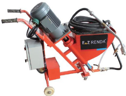
EZ Renda - Spray Machine

One of our Construction support system brand is EZ RENDA product is an automatic rendering machine most suitable for building construction projects. Seeing that construction projects becoming more and more sophisticated and reliable consistent labour has become more and more rare for the last few years. GNI sees EZ Renda as highly desirable product for the construction industry.