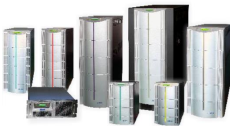
SIERRA UPS Systems