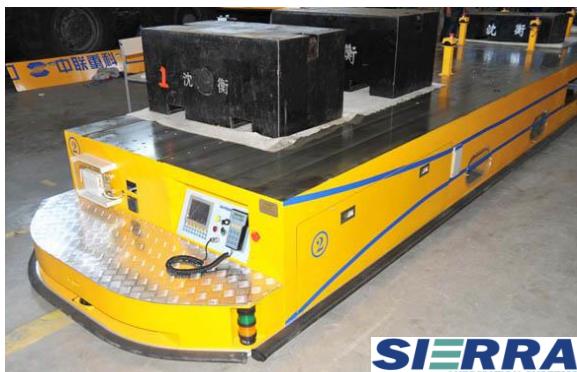
SIERRA Industrial Automated Guided Vehicle (AGV)

Residential and Commercial Building has now demanded for an improvement in quality, security and adjustability in their environment. SIERRA provides residential and commercial building with a system that communicates with your smartphone devices or building control system, while maintaining affordability.