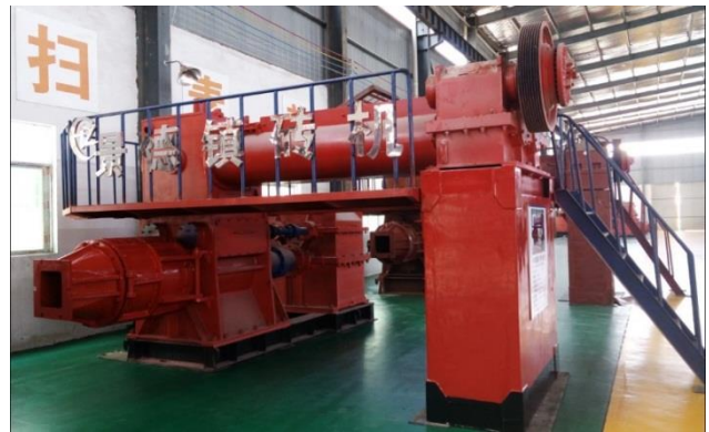
Brick Manufacturing Machine