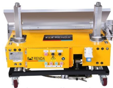
EZ Renda – Wall Rendering Machine